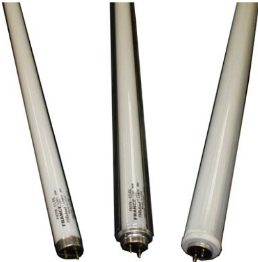
LONG-LIFE T8 LAMPS