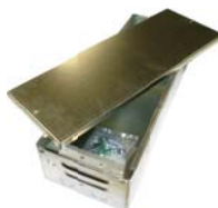
LED WARRANTY POLICY